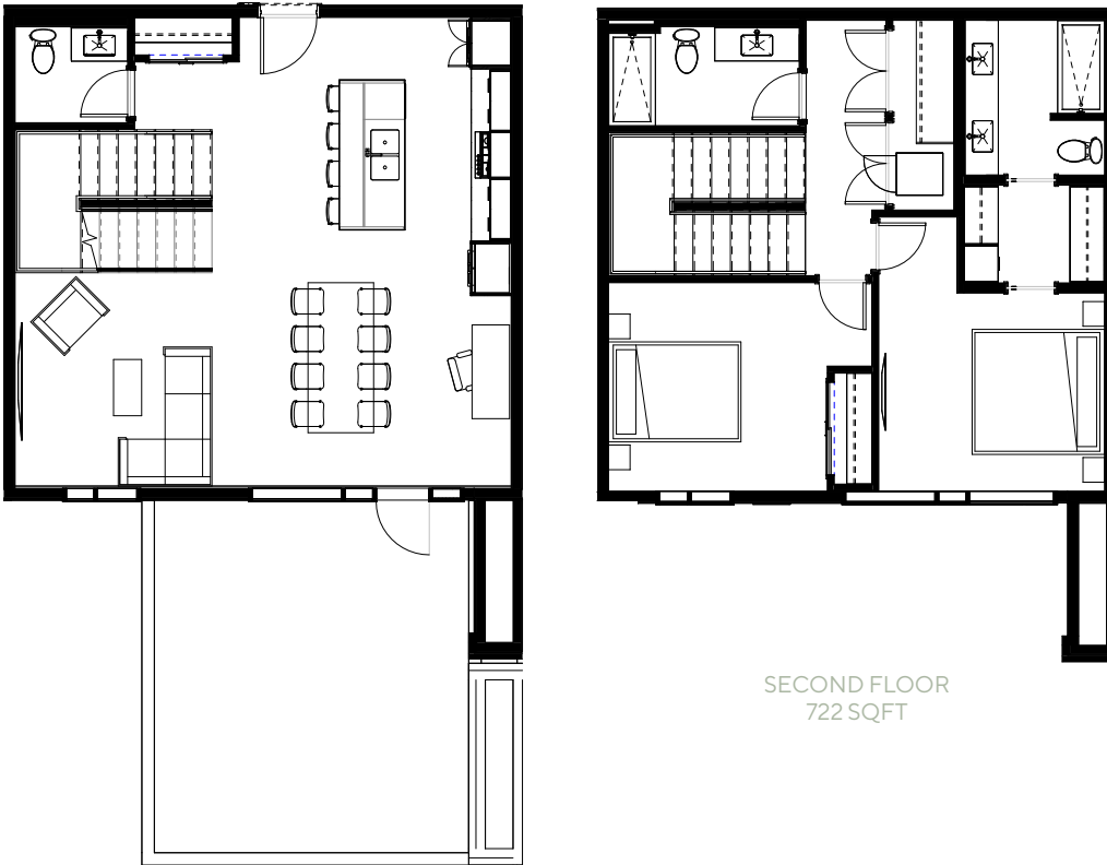
MAIN FLOOR 722 SQFT